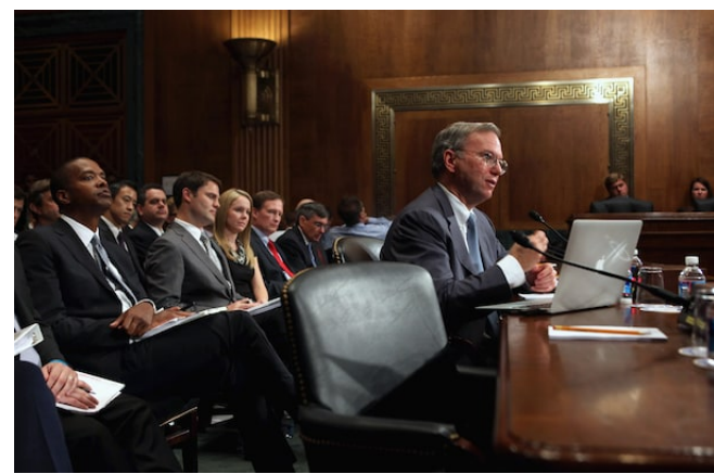
subcommittee in September 2011.

Days earlier, Schmidt had endured a rare and unnerving appearance on Capitol Hill, where he was lectured by a Republican senator who accused the company of skewing search results to benefit its own products and hurt competitors. The FTC antitrust inquiry was underway. And, in what Google saw as a direct threat to the open Internet, major lobbies such as the U.S. Chamber of Commerce and the Motion Picture Association of America were mounting a legislative campaign to place restrictions on the sale of pirated music and movies. The effort was getting bipartisan traction in the House and the Senate.